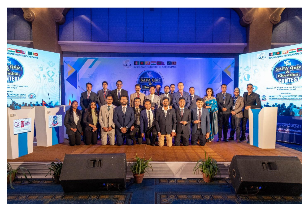
Glimpse of SAFA Quiz and Elocution Contest, 2022