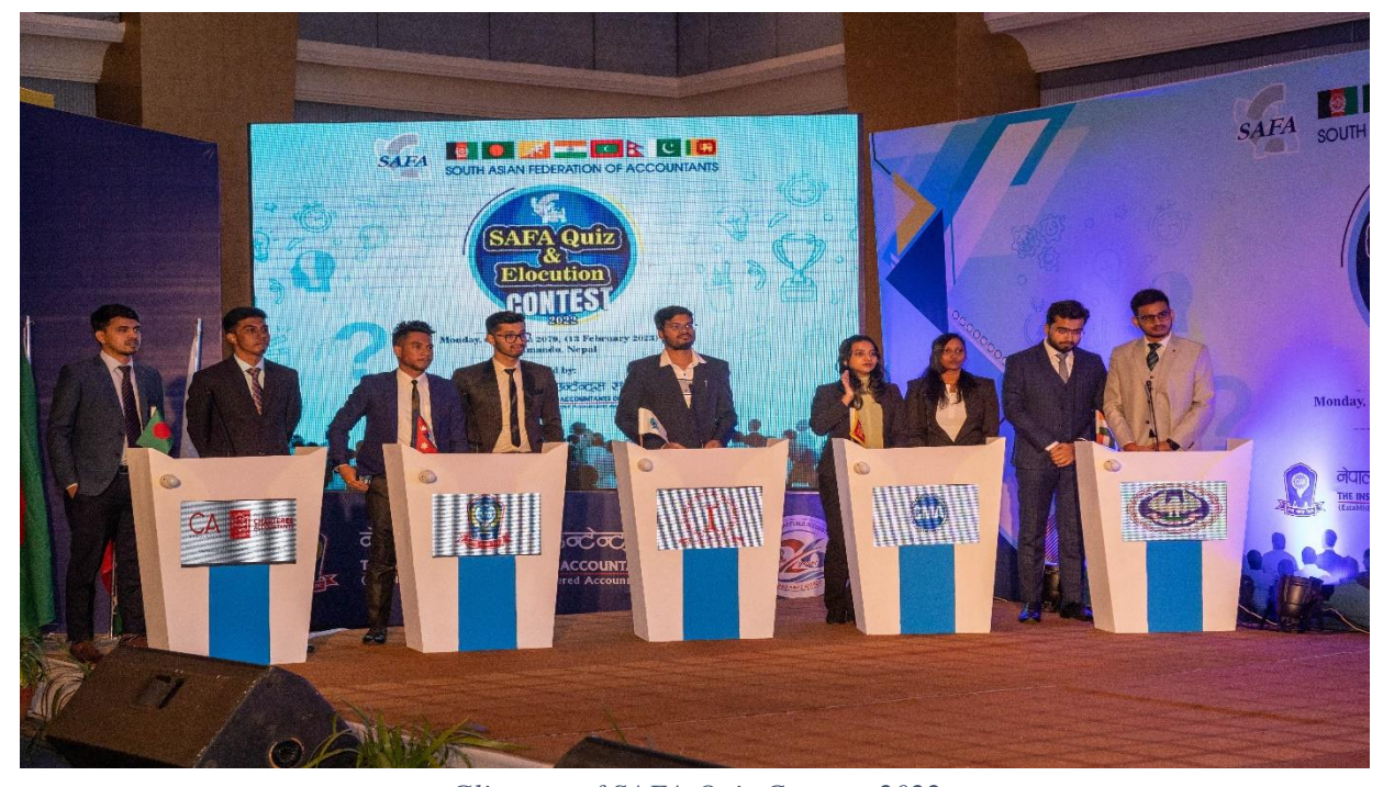
Glimpses of SAFA Quiz Contest, 2022