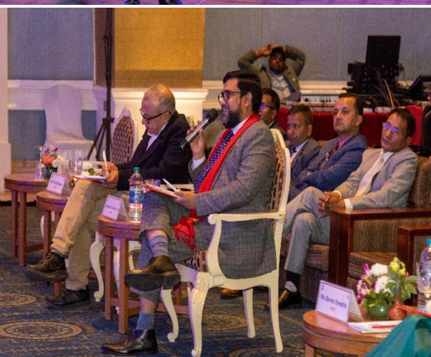
Glimpses of SAFA Elocution Contest, 2022