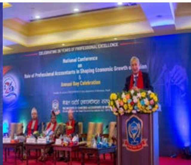
Dr. Yuba Raj Khatiwada, Former Minister of Finance delivering Keynote Speech