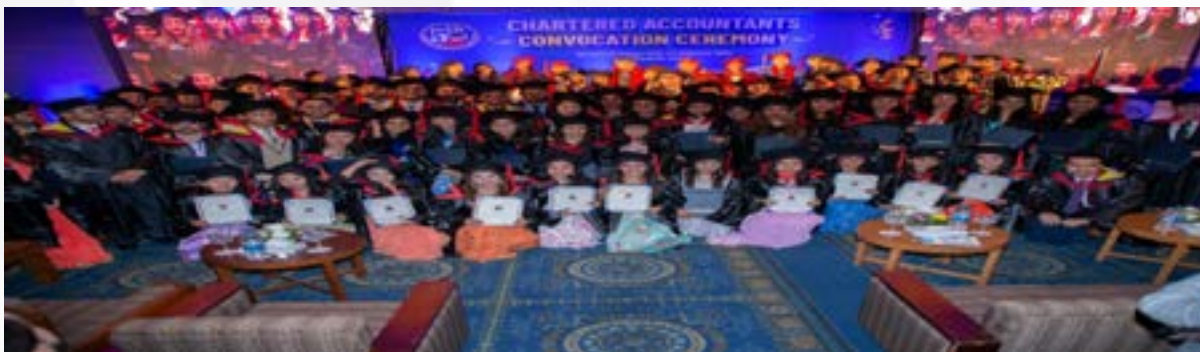
Group Photo of the participants of 5th Chartered Accountants' Convocation Ceremony