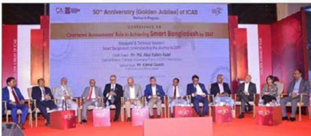
Technical Session I: Chief Guest, Special Guest and Resource persons