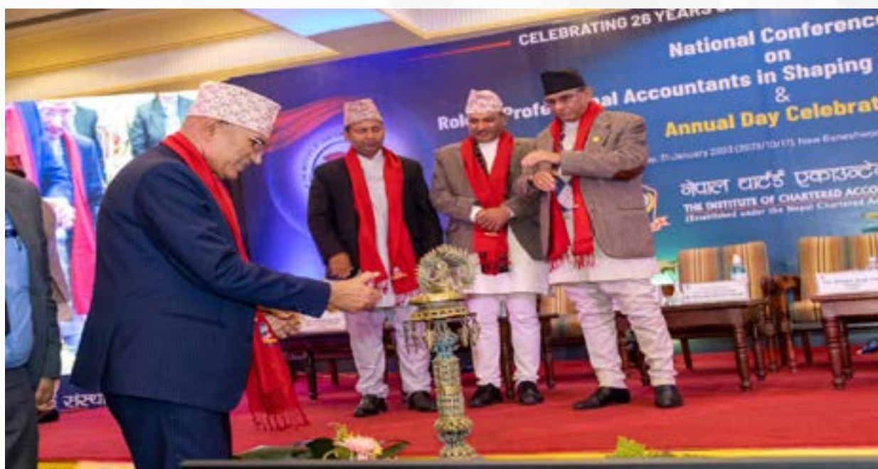
Hon'ble Deputy Prime Minister and Finance Minister, Mr. Bishnu Prasad Paudel inaugurating the program.

The program was inaugurated by Chief Guest of the program by lightening the lamp. The Chief Guest delivered his speech congratulating the Institute for celebrating its 26 th year of establishment and elaborated the role of Institute for economic development of Nation.