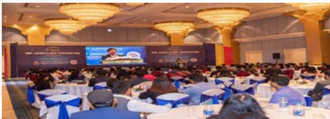
Glimpse of Pre- Articleship Orientation Training

The Institute organized Pre-Articlesip Orientation Program for the students who have passed CAP II level examination of December 2022 on 23 rd February 2023 at Hotel Yak and Yeti, Durbarmarg, Kathmandu, Nepal. The purpose of this orientation program was to enhance the skills and capabilities of students going to pursue three years articleship training by providing proper orientation and training on personality development, communication skills, professional behavior and culture at audit firms and clients' offices. The program was broadcasted live in branch offices of ICAN for the students residing outside of Kathmandu Valley.